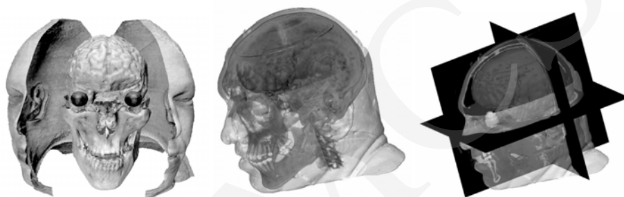
Fig. 3. Three-dimensional visualization techniques: (from left) surface rendering, combination of volume and surface rendering, 3D-slices combined with surface rendering

been performed on a PC system (Athlon XP 3200+ 2.2 GHz, 512 MB RAM). The matching process of the MRI and RGB datasets using the mutual information measure and the Powell's optimization method took 20 minutes 41 seconds (two-step rigid and affine multi-resolution approach) and required 2531 evaluations of the mutual information objective function. In the second case (CT and RGB datasets) the total running time took 4 hours 50 minutes 4 seconds (two step multi-resolution approach) and the mutual information function has been evaluated 1735 times.