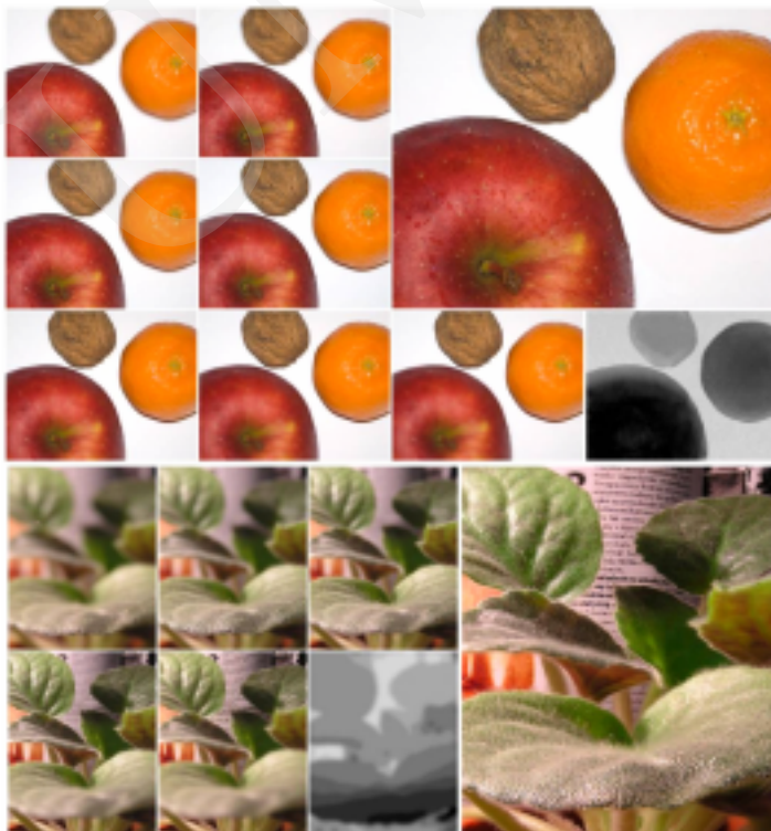
Fig. 3. Multifocus Image Fusion example sets. Small images are part of the original multifocus image set; last small, blurred image is the Height Map; large image is the fused image