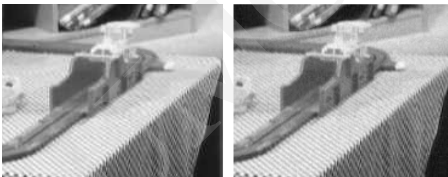
Fig. 3. Enlarged fragment of the test image compressed using the DCT-based (JPEG/JFIF) and 2DKLT-based algorithms

Figure 3 shows a comparison of the two compression methods: DCT-based (on the left) and 2DKLT-based (on the right). Enlarged fragment of the test image shows that the 2DKLT-based compression gives much more details reducing blurring of individual blocks. It is a result of optimal adaptation of basis functions for this specific image.