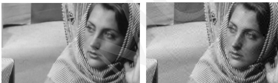
Fig. 5. Fragment of the original test image and its stegoed variant

KLT spectrum of its pixels. Hence, the message is being expanded into a longer sequence of small values e.g. binary ones. Then we have to generate a key which will determine where in the transformed blocks the elements of expanded message have to be placed. The key is a sequence of offsets from the origin of each block. It is important to place the message into the “middle-frequency” part of each block as a compromise between output image quality and robustness to intentional manipulations. This rule is especially significant in the case of images containing a large number of small details, which helps keep all the changes imperceptible. The only noticeable difference can be observed in the areas of uniform color. As an example of the embedding, the following image is presented (see Fig. 5).