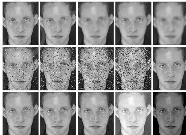
Fig. 5. Example original image and its distorted variants: median filtered (mask 3 \times 3 and 5 \times 5 ), low-pass filtered (mask 3 \times 3 and 5 \times 5 ), contaminated by the salt and pepper noise (5%, 10% and 20% of pixels), JPEG compressed (quality: 60%, 40%, 20% and 10%) and intensity offset change (+20,-20), respectively