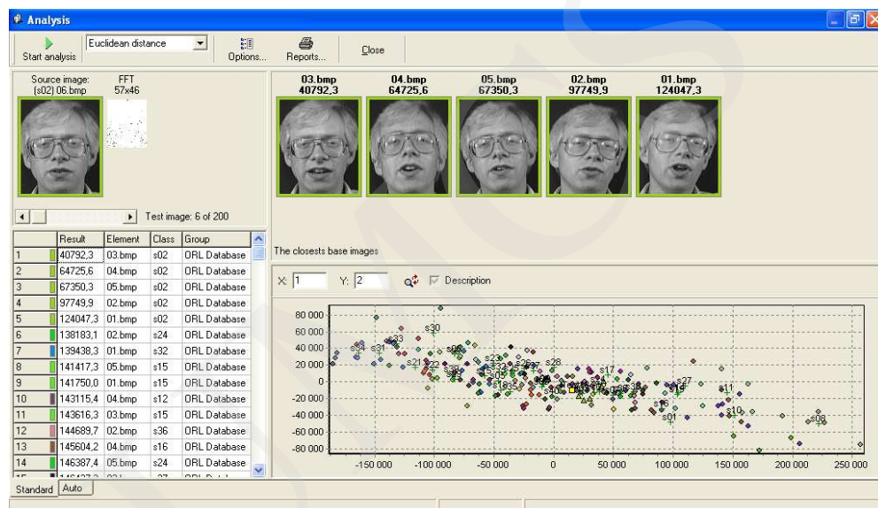
Fig. 3. Sample results of recognition in the FaReS environment (overall recognition rate equal to 95%)

The classification employs feature space created for all face images in the database. A query face is projected into it and Euclidean distance is being calculated. Two alternative distances are taken into consideration: the first one is a distance to all elements, whereas the second one is the distance to the centers of all classes only ( \bar{X}^{(k)} ). The latter approach is easier to perform and requires much fewer computations, however, its efficiency is lower in the case of irregular clusters. One of the recognition experiments is presented in Fig. 3. It was performed in "FaReS-Modeller" Environment [9]. As it can be seen from the figure below, it gives 5 nearest images from the database for a query image ("source image" in the picture), sorted in the decreasing similarity order.