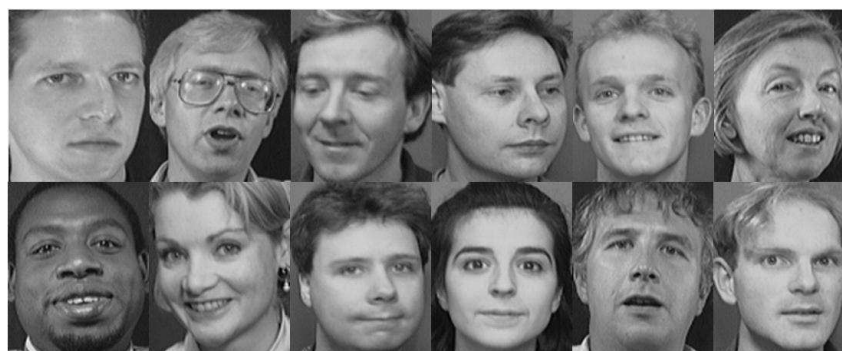
Fig. 1. Example images from AT&T database used in experiments