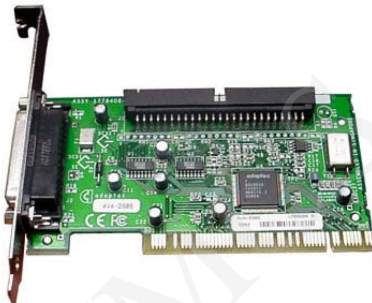
Fig. 2. Adaptec AHA 2906 controller.

For practical reasons (good quality development tools and documentation without restrictive license limits), our work is carried out in the GNU/Linux operation system environment with the application of a gcc compiler.