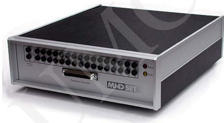
Fig. 1. Mindset MS-1000 EEG System.

MindSet MS 1000, manufactured by Nolan Computer Systems, is used as the hardware source of an EEG signal (Fig. 1). It is a real-time device containing a 16-channel analogue differential amplifier which receives signals from cap electrodes and amplifies them 32000 times. An amplified analogue signal is converted into a digital one as it goes through sample-and-hold circuits and an analogue-to-digital converter. Inside the device, there is a 32kB RAM buffer enabling it to withstand arrhythmical cooperation with a PC [9].