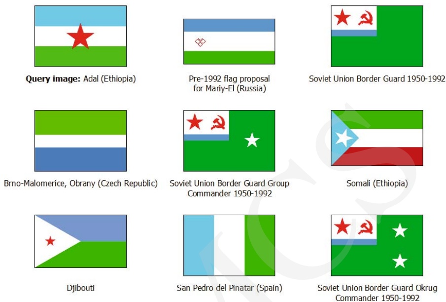
Fig. 2. Sample retrieval results. The most up-right image is a query object.