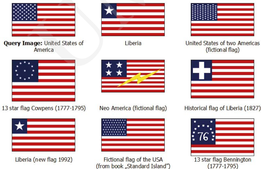
Fig. 3. Sample retrieval results. The most up-right image is a query object.