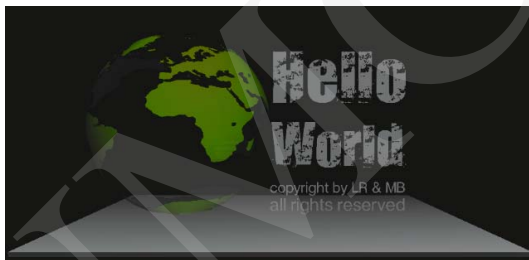
Fig. 5. A complex exhibit with an animated rotating object and a column of text labels.

The above line creates a Slide exhibit, which will contain a title and a bullet list in a column. The Slide constructor creates Label objects out of the string constants and determines their size. The title will be automatically resized to take up the whole exhibit width and the bullets in the list will be resized to have the same font size.