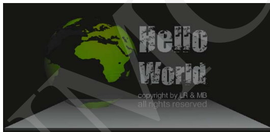
Fig. 5. A complex exhibit with an animated rotating object and a column of text labels.

The above line creates a Slide exhibit, which will contain a title and a bullet list in a column. The Slide constructor creates Label objects out of the string constants and determines their size. The title will be automatically resized to take up the whole exhibit width and the bullets in the list will be resized to have the same font size.