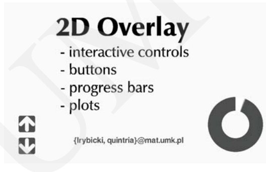
Fig. 4. Presentation of the 2D Overlay: two buttons, a static label and a circular progress gauge to-gether with a slide exhibit.

up.onClick = &display.camera.forward; down.onClick = &display.camera.back;