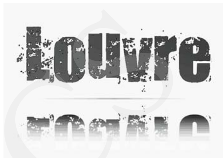
Fig. 1. The project logo as an exhibit.