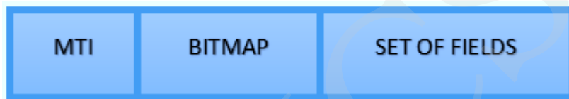
FIG. 2. Structure of ISO 8583 message

The whole standard is defined in ISO 8583 Financial transaction card originated messages Interchange message specifications. It is the binary protocol defined by International Organization of Standardization and intended for the systems that exchange electronic transactions made by cardholders using payment cards. ISO 8583 defines a communication flow and a message format so that different systems can exchange these transaction requests and responses [5]. Fig. 1 presents the structure of ISO 8583 message.