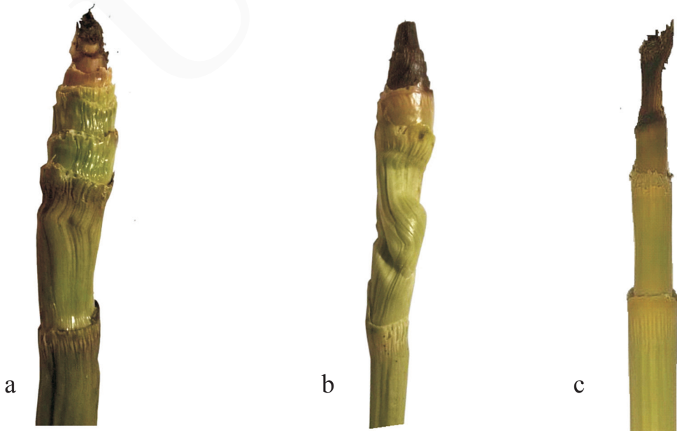
Phot. 2. Basal part of galls with leaves removed: apically widened gall of L. pullitarsis – a, rod-shaped gall of L. pullitarsis – b; gall of L. similis – c