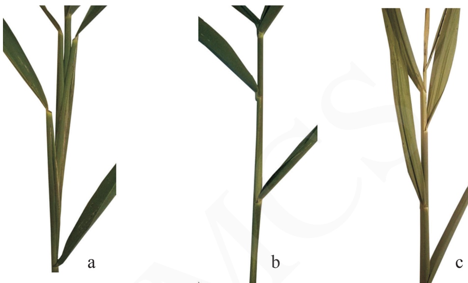
Phot. 1. Galls produced by Lipara flies (external appearance): L. pullitarsis – (a–b), L. similis – c