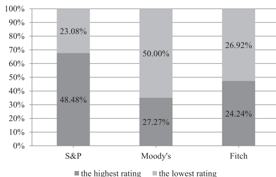
Figure 3. The highest and the lowest rating awarded by agencies

Furthermore, the analysis of the ratings awarded to the issuers by individual agencies was carried out, in order to check which agency gave the highest and the lowest credit ratings. For this purpose, the issuers which received the ratings from two or three agencies were analyzed. The issuers which received the rating only from one agency were excluded from this sample. The analysis does not also include the situations where the assessment of the agencies was the same.