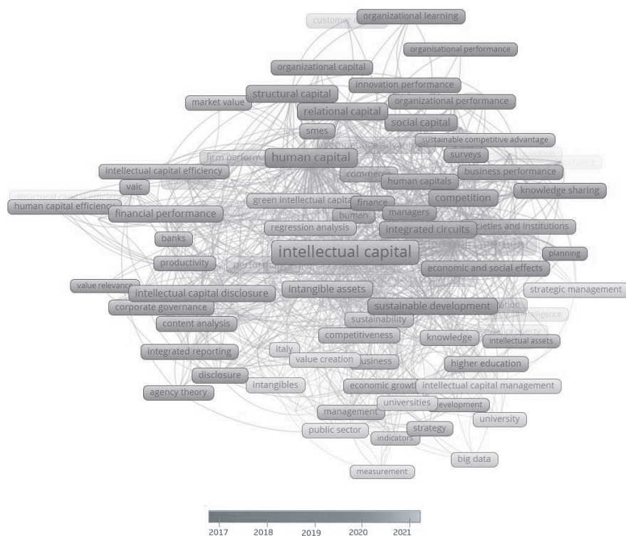
Figure 4. A map of trends in the studies on intellectual capital during the years 2017–2021

The map of trends reflects the wide scope of the issues addressed over the years. The chronological outline presented indicates that the interest in the concept of intellectual capital management still continues and the dynamics of changes in the environment of a contemporary enterprise is not at all insignificant, but the changes are evolutionary rather than revolutionary.