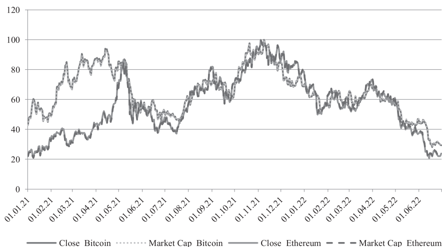
Figure 3. Standardized time series of Bitcoin and Ethereum quotations by Close and Market Cap categories in the period January 2021 – June 2022