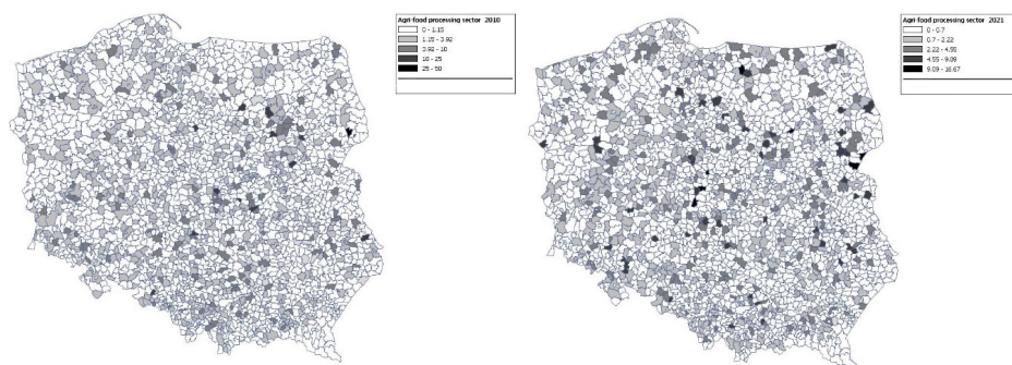
Figure 2. Spatial diversification of new registered agri-food processing sector entities in analyzed years