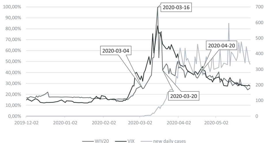
Figure 1. WIV20 and VIX indexes (a proxy of fear) and new daily cases of COVID-19 infection in Poland

Figure 1 presents the WIV20 and VIX indexes and new daily cases of COVID-19 infection in Poland during the period analyzed. This shows the relation between epidemic growth in Poland and increasing fear in the local and global context.