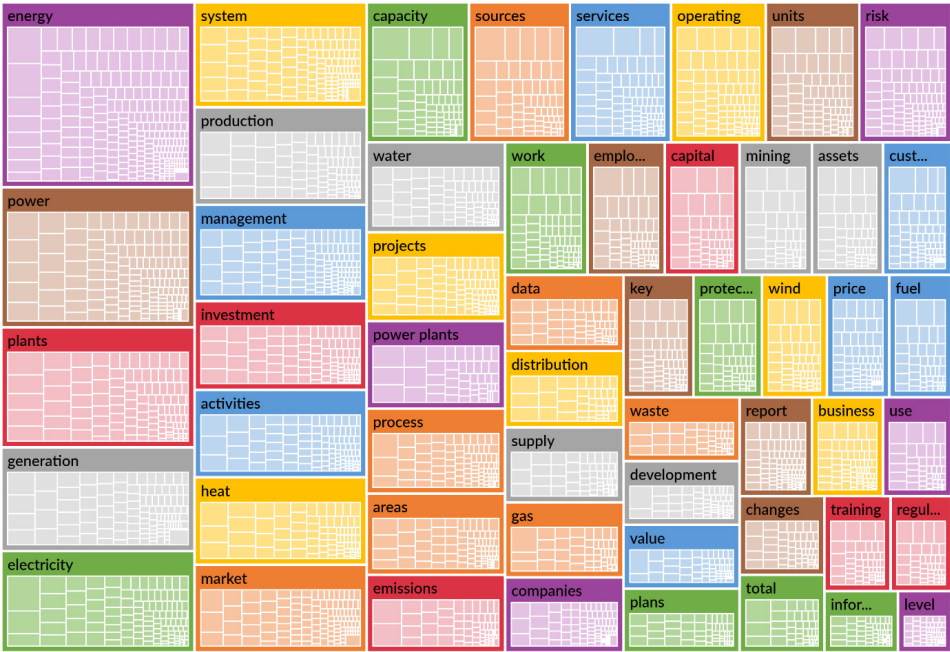
Figure 1. Hierarchy Chart – compared according to the amount of coding references (reports: ENA, PGE, TPE, ZEP)