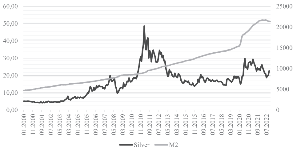
Figure 2. Silver price and USD supply measured by M2

In the case of silver market analysis, another indicator that may be important in determining the impact of external and non-market factors on its price is the money supply as measured by aggregate M2 (cash in circulation and deposits) in the United States (Figure 2).