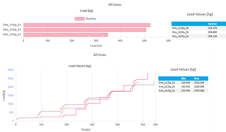
Figure 3. View of the employee weight load analysis chart

The weight lifted, deposited by the worker, is determined in PFEP (Pawlewski, 2018a) in a database that is an integral part of the digital twin and is automatically shown in graphs as a function of time – Figure 3.