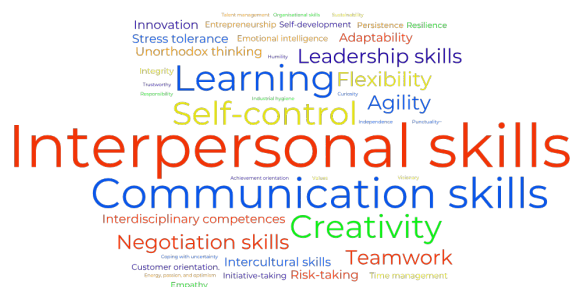
(c) social competencies