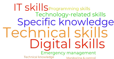
(b) functional competencies