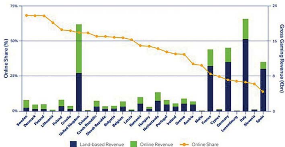
Figure 1. GGR levels of EU member states and the UK in 2023