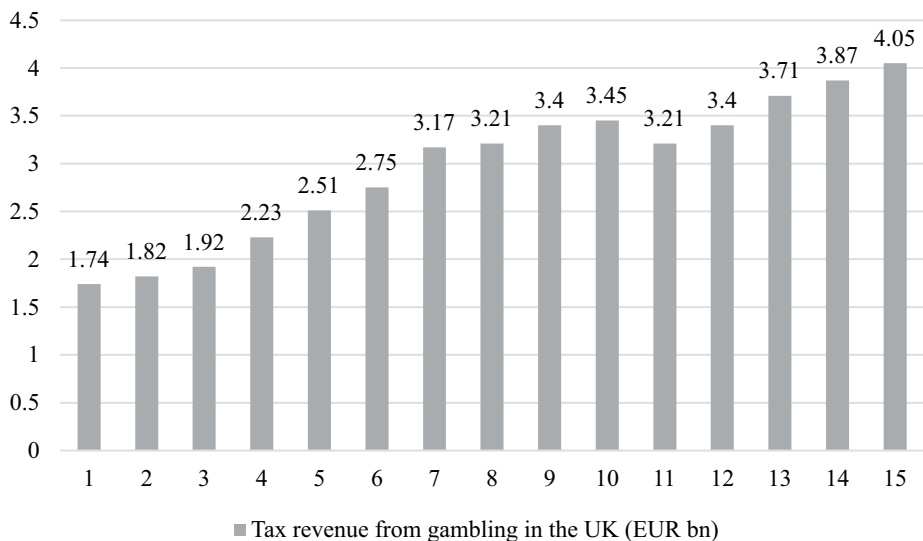
Figure 4. UK's tax revenue from gambling 2010–2024