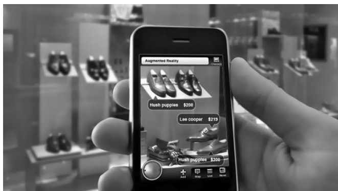
Figure 1. Augmented reality in the point of sale – a shoe shop

land, AR utilization for marketing purposes is still rare, but in the world it develops faster and faster. AR can also add variety to any kind of events, fairs, or business meetings, as well as occasional parties 3 . Figure 1 presents the possibility to use AR in the point of sale – a shoe shop.