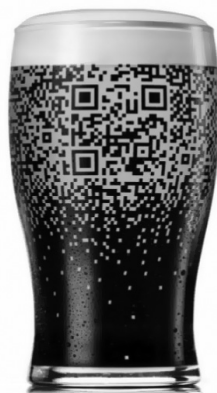
Figure 3. Creative utilization of QR code – Guinness brand