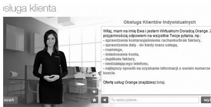
Figure 4. Virtual Orange Advisor – Ewa

An example of chatbot application in marketing communication is the Orange company. It has put in motion the Virtual Advisor Ewa on its own www page (Figure 4). Besides the extensive base of issues connected with customer service, this chatbot is able to answer a number of other questions 7 .