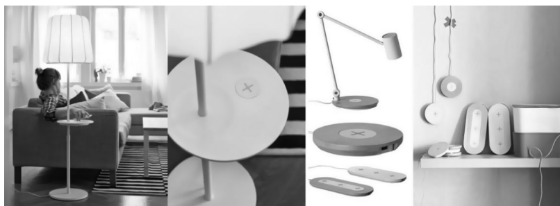
Figure 5. Internet of Things – IKEA