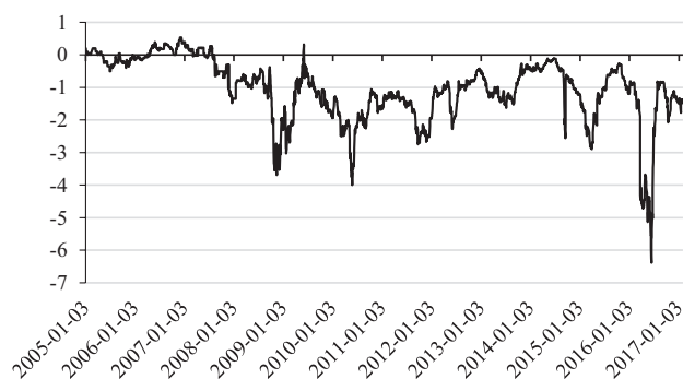
Fig. 2. A 25-delta risk reversal of USD/GBP exchange rate during the period 01.2005–01.2017

Another event that highly affected the value of Japanese currency was Pacific typhoon (Fig. 1, IV) that took place in September 2011. Despite the natural disaster in Japan, market participants placed higher probabilities to large appreciation of Japanese yen. As a result, the currency became stronger although there were no sufficient fundamental reasons for it. It is worth emphasizing that, since the mid-1990s, there have been 12 episodes during which the value of Japanese yen has increased by more than 6% (in nominal terms) within one quarter [Botman, Kang, 2015]. Moreover, these periods often coincided with events outside Japan. It shows that the value of Japanese currency is highly affected not only by economic, fundamental factors, but also by global changes in investors' mood, risk perception and global risk aversion.