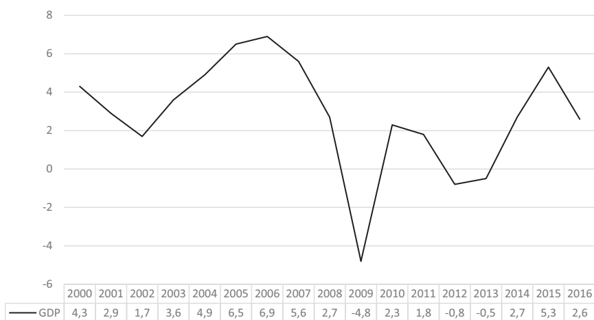
Figure 1. Dynamics of GDP in the Czech Republic (2000–2016)

At the beginning of 2013, the Czech economy was affected by the second wave of the crisis. That was caused by the European debt deficit and the effects of internal fiscal consolidation. These effects appeared mainly on the consumption side – the