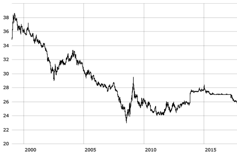
Figure 3. Fluctuations in the crown's rate in relationship to the euro, 2000–2017