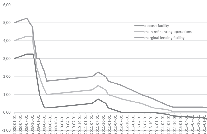
Figure 1. Changes in the European Central Bank interest rates between 1 January 2008 and 31 December 2018

The European Central Bank introduced its anti-crisis monetary policy relatively late. The US Federal Reserve System began a series of interest rate cuts as early as September 2007, but the ECB decided to do so more than a year later. In mid-2012, the deposit rate was 0%, and since June 2014, it has been negative. Since September 2014, the base reference rate has been close to zero. Figure 1 presents the data on the changes in the base interest rates of the ECB.