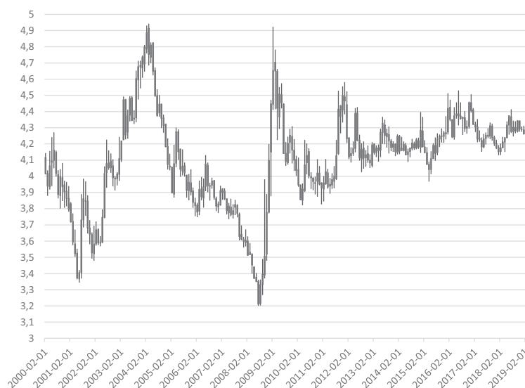
Figure 2. EUR/PLN spot rate, 1-month candlestick (February 2000 – March 2019)