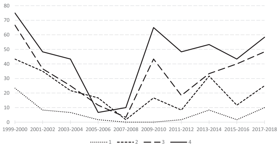
Figure 2. The average percentage of cases in which the returns were normally distributed, taking into account all tests performed and all indexes presented for each two-year sub-period and each returns' interval