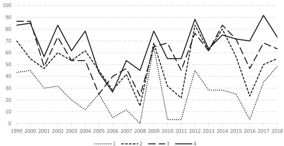
Figure 1. The average percentage of cases in which the returns were normally distributed, taking into account all tests performed and all indexes, presented for each year and for each returns' interval