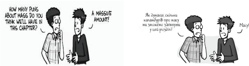
Figure 3: The “Mass” pun in the original and translation

Transferring the verbal component with the help of direct equivalents does not automatically entail preserving the wordplay (as we could see in the above example). It is also important to preserve the original ambiguity rooted initially in verbal semantic asymmetry, but also in interaction between words and pictures. In the following example, the pun is constructed on the basis of two different meanings of massive – 1) relating to mass; 2) exceptionally large: