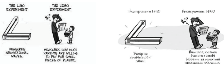
Figure 5: The “LIGO/LEGO” pun in the original and translation

According to the third strategy (of “zero translation”), the verbal component of the pun remains in its original form completely or partially, and the visual component remains intact as well. In the situation of English–Ukrainian translation when two involved languages employ different alphabets (Roman and Cyrillic, correspondingly) this strategy can yield any positive result only when the original verbal element of the pun is familiar to the target reader as well. In the following example, we deal with what may be called “an acronym pun”, that is the one in which the combination of the first letters of an expression/compound nomination reproduces the form of another word. In our case, acronym LIGO stands for Laser Interferometer Gravitational–Wave Observatory . The wordplay is based upon the formal resemblance between LIGO and LEGO (famous brand of children’s toys). While LIGO is present and properly explained in the verbal context, LEGO only appears as part of the multimodal pun: