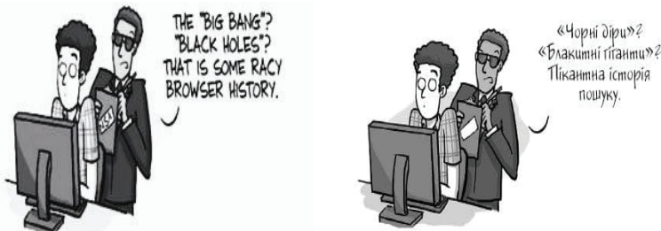
Figure 4: The “Big bang/Black holes” pun in the original and translation

In the following example, the pun is based upon double meanings of expressions big bang and black hole referring simultaneously to the sphere of physics and sexual encounters: