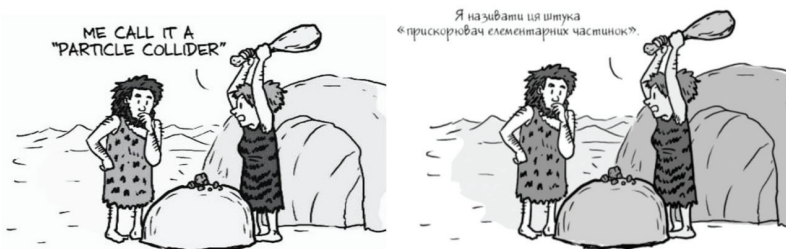
Figure 1: The "Particle collider" pun in the original and translation

In translation, the pun is virtually lost, since the translator could not find necessary equivalents suitable for expressing both meanings, and instead recreated its first meaning that was only implied in the original: