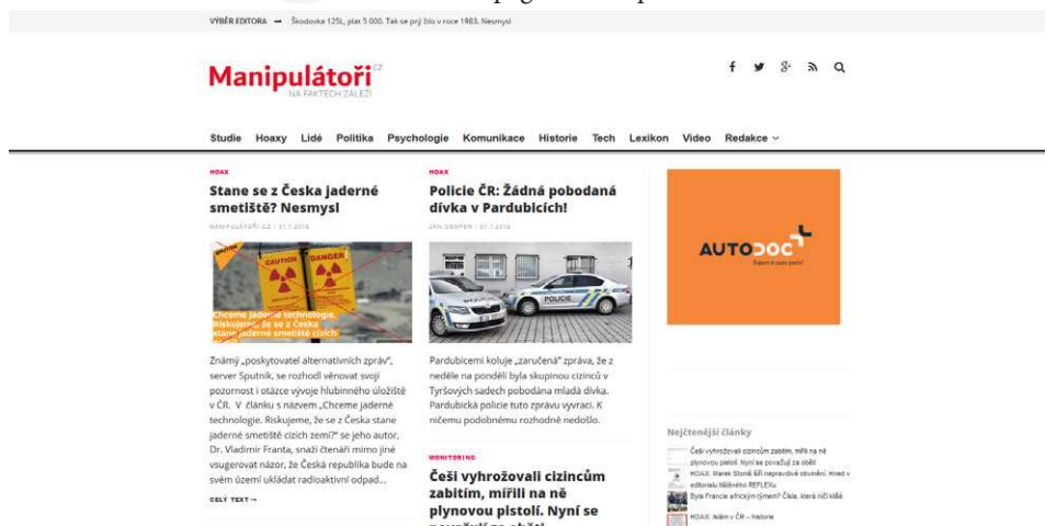
Photo 2. Home page of manipulatori.cz