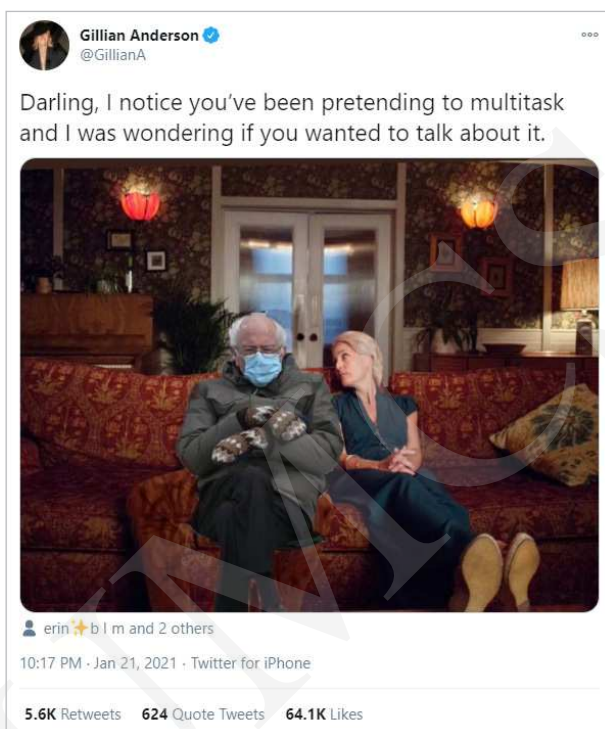
Fig. 6: Celebrities such as actress Gillian Anderson contributed to election memes spreading, sharing variations of “Bernie’s Mittens”

depicted as “cool” and culturally informed both in memes and ... fan writings” (2020) which are widely created and shared. This relatable image soon lost all political significance, becoming seemingly a floating signifier without clear meaning or reference. The iconic photograph of Bernie in his mittens was inserted into anything – from pop cultural imagery such as the Totoro meme 6 to the NASA rover landing – and reproduced in many media, be it deep faked video clips or as a crocheted doll.