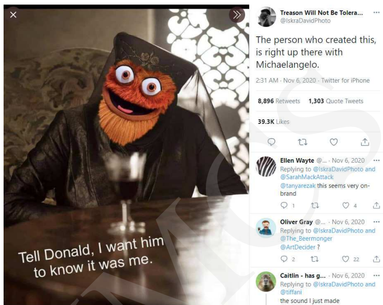
Fig. 3: Example of Gritty meme with high intertextuality by @IskraDavidPhoto (2020)

While the framing is similar to the previously discussed examples, in memes such as this 3 , several elements come together to create the multi-layered joke of the meme: Gritty's head is super-imposed on Olenna Tyrell, a character from HBO's Game of Thrones series. The show's quote is slightly altered to refer to Donald Trump, once again taking the place of a hated villain, this time Game of Thrones ' king Joffrey. Denisova (32) points out that "memes are coded messages and therefore can be confusing for various people: members of the audience may have varying abilities and skills to read the 'code'" in such cases. Here it is both necessary to know the context of the quotes – Olenna admitting to the murder of a tyrant king – and the event it references, with the implied metaphorical murder being Trump's loss of the election, which was attributed to the votes of leftist Philadelphians, as Pennsylvania flipping blue was seen as the key event cementing Biden's victory, metonymically referenced through Gritty.