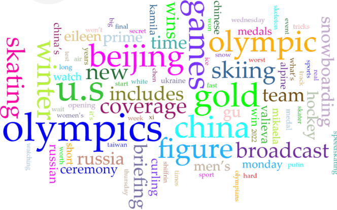
Figure 2. Words with frequency greater than 3 in the New York Times

As shown in the figure, the high-frequency words in the People’s Daily are closely related to the research topic. The most frequently used term is literally “Beijing 2022 Winter Olympics” itself. Additionally, there are no negative terms observed in the figure.