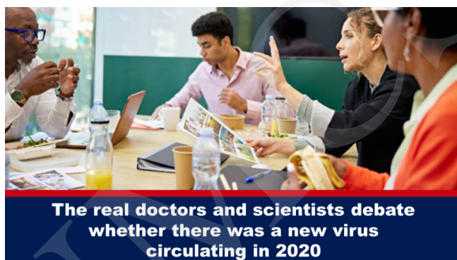
Figure 9. The Exposé, accessed on 19.01.2024.

The accompanying image includes what seems to be a representation of the vaccine and a syringe against a backdrop of what might be virus as well as a human heart. The use of the heart image alongside a sharp medical instrument, such as syringe, may elicit an emotional response concerning health and mortality, which are critical issues that affect everyone. Based on that it is to be assumed that the function of the image is evaluation, and the relationship between the image and text appears to be overlap, as the meaning is expressed metonymically.