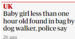
Figure 7. The Guardian, accessed on 19.01.2024

The parameters of newsworthiness present in this newsbite are enacted through emotivity as reels under carries a personalizing connotation. Moreover, the claim It's the work of... expresses certainty, which refers to the parameter of reliability that is connected to epistemic modality or modalization in systemic functional linguistics.