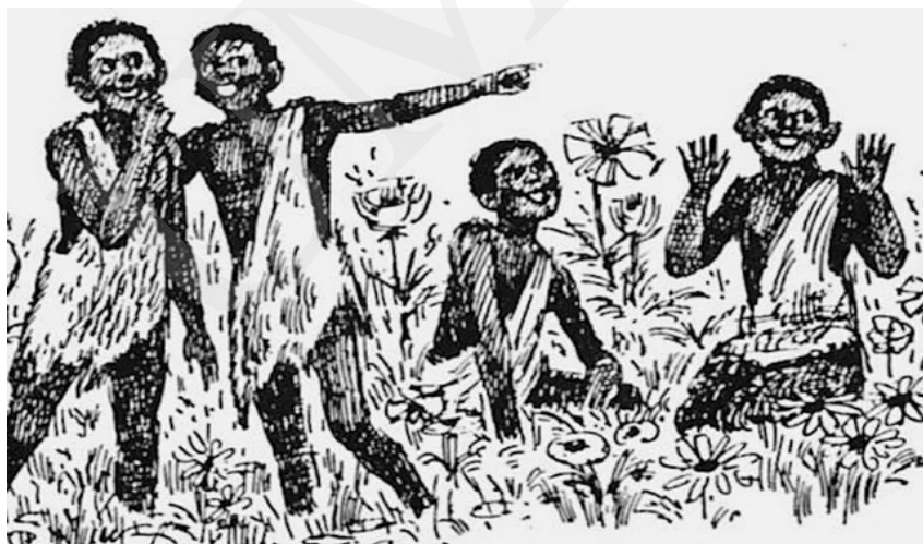
Picture 1. Black Oompa-Loompas illustrated by Faith Jaques in 1977 (copied from Treglown 1994).

The picture below presents illustrations in the first British edition in 1977, made by Faith Jaques.