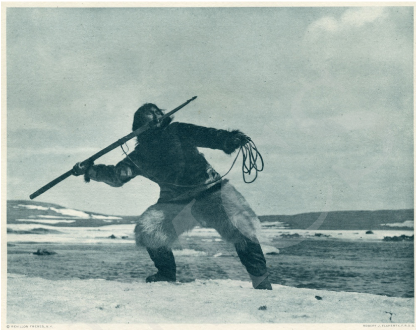
Fig. 2 Publicity still from Nanook of the North (1922) produced by Révillon Frères.

Despite Ruby's insistence on a moderated approach to Flaherty's work, a consistent critique of Nanook rests on the film's skewed portrayal of Inuit life. On the one-hundredth anniversary of the film's release, The Economist (2022) published an article tellingly titled "The vexed legacy of 'Nanook of the North.'" The subtitle read: "A century ago, Robert Flaherty released a pioneering documentary film. The problem was that it was staged." A more damning critique comes from Adam Piron (2022) writing for Documentary Magazine , bluntly referring to the legacy of Nanook as a "100-year stain." Indeed, a perfunctory Internet search for "Nanook" and "staged" returns hundreds of results. While many are clickbait, others like those from The Economist and Documentary Magazine seem caught in a kind of feedback loop, applying contemporary critiques about issues of power, authority, and authenticity in documentary film to Nanook , a film Flaherty never claimed to be objective.