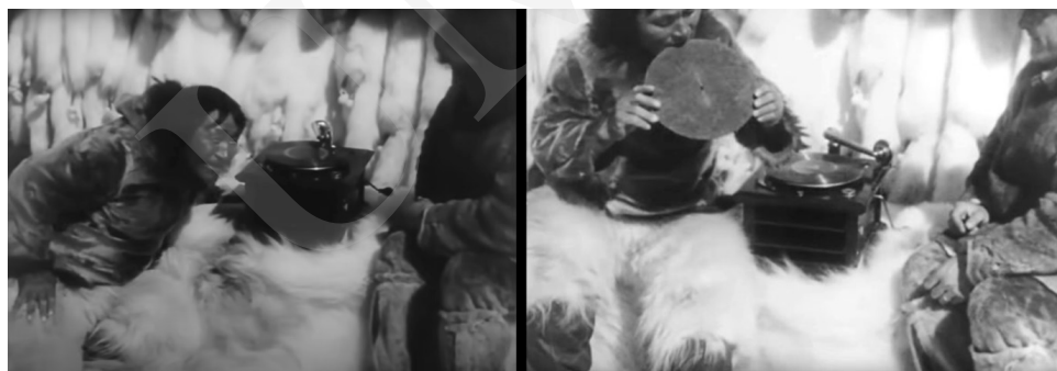
Fig. 4 Nanook encounters the gramophone. Stills from Nanook of the North (1922).

Just as individual scenes were arranged to fit the film's narrative, so too was the general portrayal of the Inuit crafted to emphasize tradition and exclude contact with modernity. For example, Flaherty discouraged the use of rifles during hunting scenes, despite their established role in Inuit subsistence practices by the early 20th century. Such constructed primitivism is also apparent in the gramophone scene, in which Nanook, seemingly encountering the device for the first time, bites into a gramophone disc in comic confusion. The moment reduces him to a figure of naive curiosity, a "happy-go-lucky Eskimo" according to one of the film's title cards. In truth, by the 1920s many Arctic communities were familiar with outsiders and trading posts where items like gramophones and rifles were common. Though engaging for the viewer, such mischaracterizations underscore Flaherty's narrative priorities that favored past practices over present realities.