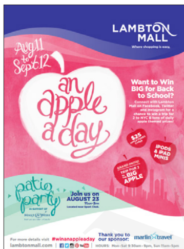
Figure 1a. Advertisement of the Lambton Mall ( http://click-sarnia.com/apple-day-lambton-mall-contest/ , retrieved 20 February 2016)

Moreover, modern advertising business relies heavily on the persuasive power of proverbs, frequently building its eye-catching slogans upon their structure. As an illustration, consider the advertisement by the Lambton Shopping Mall (Figure 1a).