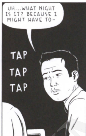
Fig 8. Tomine, A. (2012). Shortcomings . London: Faber and Faber, p. 58.

Another element of pictorial conventions exercised in Shortcomings is sound effects. Onomatopoeic expressions were ‘translated,’ i.e., replaced by echoic words which comply with Polish conventions, as exemplified by the following excerpts: