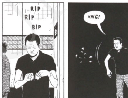
Fig 4. Tomine, A. (2012) Shortcomings . London: Faber and Faber, p. 104.

Motion lines are scarce and subtle and appear usually when Ben slams the phone or throws something on the ground: