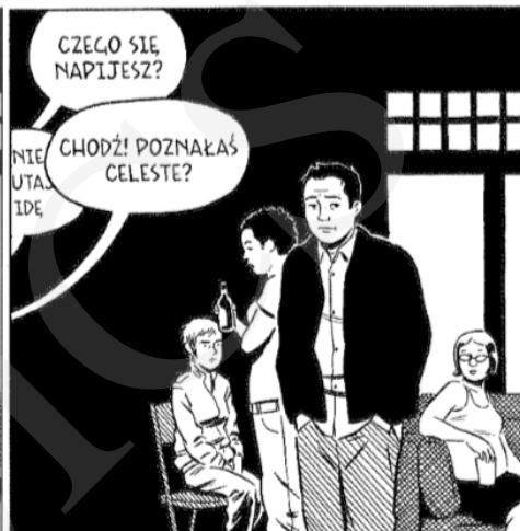
Fig 13. Tomine, A. (2010). Niedoskonalości . Trans: Murawska, A. Warszawa: Kultura Gniewu, p. 52.

This convention was maintained in all cases but one: