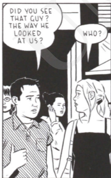
Fig 6. Tomine, A. (2012). Shortcomings . London: Faber and Faber, p. 68.

Spatial constraints are a good example of such limiting factors. Sometimes it may be challenging to fit the translated text in a speech bubble. Changing their shapes and sizes is not a common practice; not only is it costly, but it can also ruin the original composition of a panel or even an entire page. The solution provided in Shortcomings is, wherever necessary, making the font smaller, like, for example, in the second bubble in the Polish version of the following panel: