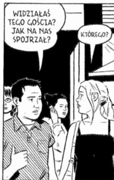
Fig 7. Tomine, A. (2010). Niedoskonałości . Trans: Murawska, A. Warszawa: Kultura Gniewu, p. 68.