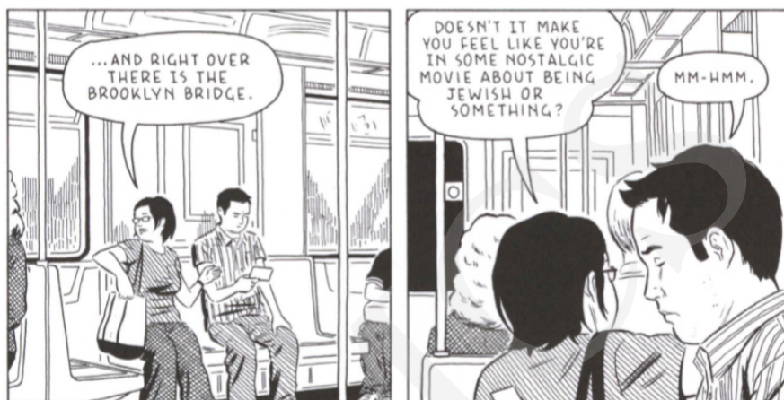
Fig 20. Tomine A. (2012). Shortcomings . London: Faber and Faber, p. 79.

A similar reference is also made by Kim, when she reflects on living in New York: