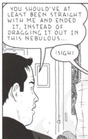
Fig 3. Tomine, A. (2012). Shortcomings . London: Faber and Faber, p. 100.

Motion lines are scarce and subtle and appear usually when Ben slams the phone or throws something on the ground: