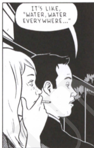
Fig 22. Tomine A. (2012). Shortcomings . London: Faber and Faber, p. 55.