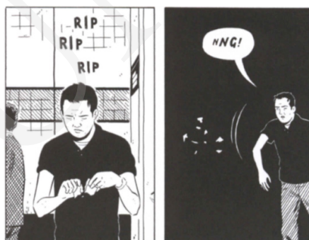
Fig 4. Tomine, A. (2012) Shortcomings . London: Faber and Faber, p. 104.

Motion lines are scarce and subtle and appear usually when Ben slams the phone or throws something on the ground: