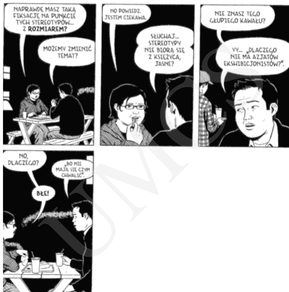
Fig 27. Tomine, A. (2010). Niedoskonałości . Trans: Murawska, A. Warszawa: Kultura Gniewu, p. 57.

The joke in the English version is based on the difference between the words ‘Caucasian’ and ‘Asian,’ which, apart from the meaning, is the syllable ‘cauc’ at the beginning of the former. The pun bases on the alleged correspondence between the length of these words and the size of Caucasians’ and Asians’ penises as well as the homophonic resemblance between ‘cauc’ and ‘cock.’ It is impossible to convey it literally into Polish, as ‘Caucasian’ translates into ‘biały’ ( white ) and ‘Asians’ into ‘Azjaci.’ There is no similarity between the two. Murawska’s solution is well-conceived, as it conveys the same preconceptions and also regards the size of phalluses in a racist, though humorous, way, even though it is realized in a completely different way. The reaction of the Polish readers is likely to be the same as that of the readers of the original.