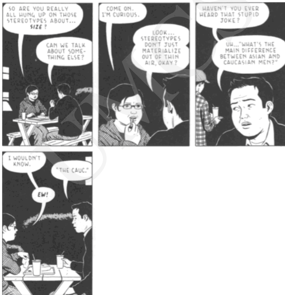
Fig 26. Tomine A. (2012). Shortcomings . London: Faber and Faber, p. 57.