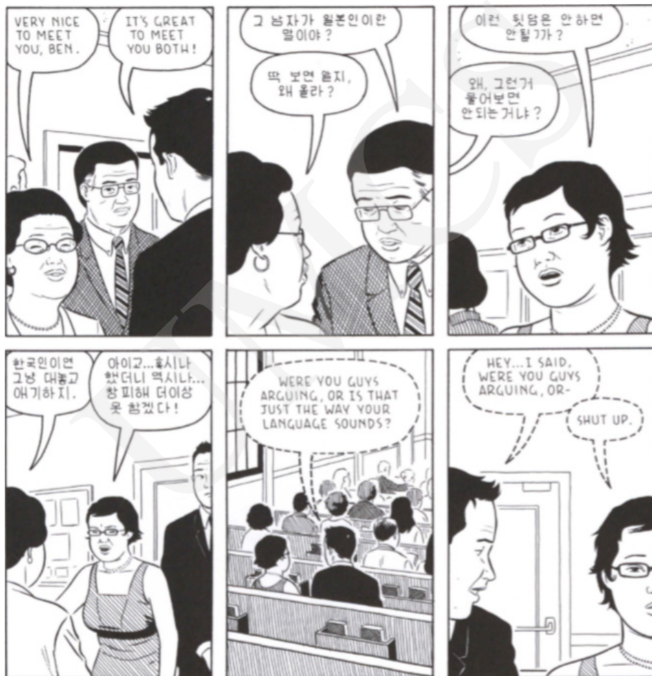
Fig 28. Tomine A. (2012). Shortcomings . London: Faber and Faber, p. 27.

The appearance of passages in Asian languages with no translation in the original is also important in terms of creating tension and depicting characters' emotions, as seen in the following excerpt: