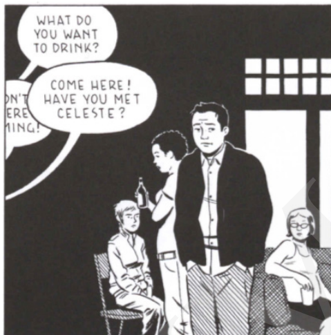
Fig 12. Tomine, A. (2012). Shortcomings . London: Faber and Faber, p. 52.

The final convention I want to point out is Tomine's way of showing how speech bubbles sometimes overlap and bleed into the text from other bubbles when protagonists interrupt each other: