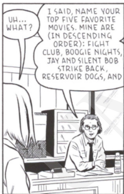
Fig 16. Tomine A. (2012). Shortcomings . London: Faber and Faber, p. 20.

Apart from the Zanettin's 'articulatory grammar' and the constraints it imposes, the language and cultural references pose challenges in Shortcomings . Allusions to other works appear; some of them are quite straightforward, as in the following frame: