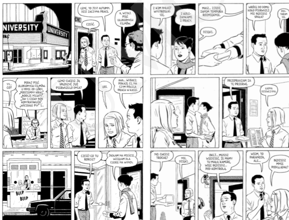
Fig 1. An example of a page composition in Tomine's Shortcomings .

Indeed, Tomine uses the comic book conventions in Shortcomings advisedly. The novel is characterized by formal minimalism and realistic depiction of diegetic space. Panels are of similar size and shape: always square or rectangular. There are six to nine of them on every page. Panel frames are regular, quite thin, unobtrusive. Breaches and bleeding out of panels never occur.