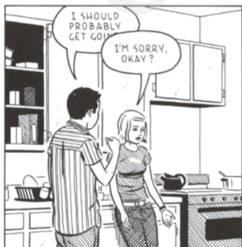
Fig 14. Tomine, A. (2012). Shortcomings . London: Faber and Faber, p. 50.

This convention was maintained in all cases but one: