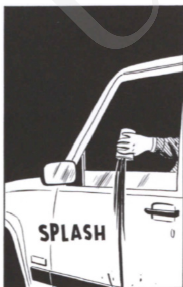
Fig 10. Tomine, A. (2012). Shortcomings . London: Faber and Faber, p. 37.