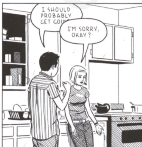
Fig 14. Tomine, A. (2012). Shortcomings . London: Faber and Faber, p. 50.

This convention was maintained in all cases but one: