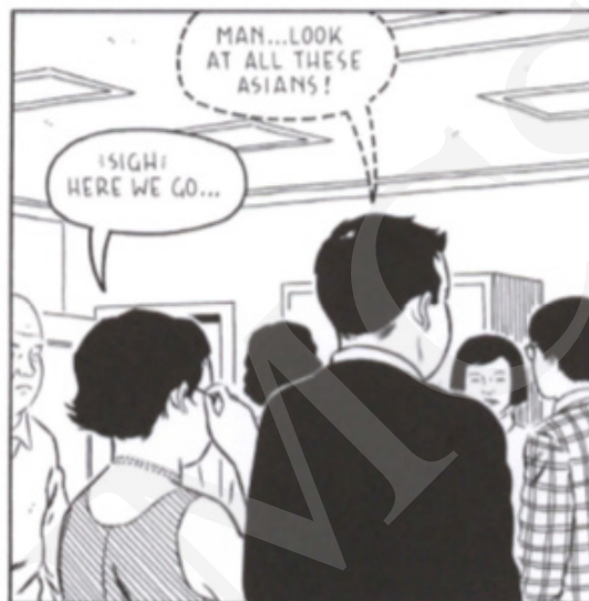
Fig 32. Tomine A. (2012). Shortcomings . London: Faber and Faber, p. 26.

Another example of misjudged translation (or rather, an editorial error) that takes away from Ben's portrayal appears in the scene at the church, when he pretends to be Kim's boyfriend so that her parents think she is heterosexual: