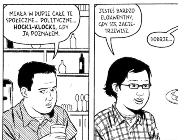
Fig 25. Tomine, A. (2010). Niedoskonałości . Trans: Murawska, A. Warszawa: Kultura Gniewu, p. 79.

‘Whatever’ translates into Polish as “cokolwiek.” It cannot be used in this context in Polish as the phrase “polityczne cokolwiek” ( political whatever ) is not something a Pole would say. The use of the word ‘whatever,’ when a speaker is not able or cannot be bothered to find an appropriate, meaningful way to express themselves, functions in English, but in Polish it would not seem natural. Murawska chose the expression ‘hocki klocki’; the word ‘hocki’ is an old Polish onomatopoeic expression which signifies ‘jumping’; ‘klocki’ means ‘blocks,’ as in ‘the LEGO blocks.’ Together, these two words rhyme, and stand for meaningless, silly matters, unworthy of any attention. It is not a literary expression; in fact, it sounds a bit awkward and obsolete. For these reasons, it fits perfectly in Ben’s complaining about Miko’s interest in politics: