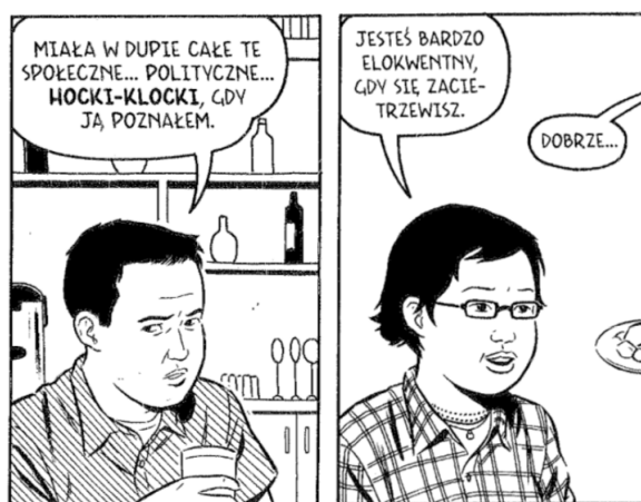
Fig 25. Tomine, A. (2010). Niedoskonałości . Trans: Murawska, A. Warszawa: Kultura Gniewu, p. 79.

‘Whatever’ translates into Polish as “cokolwiek.” It cannot be used in this context in Polish as the phrase “polityczne cokolwiek” ( political whatever ) is not something a Pole would say. The use of the word ‘whatever,’ when a speaker is not able or cannot be bothered to find an appropriate, meaningful way to express themselves, functions in English, but in Polish it would not seem natural. Murawska chose the expression ‘hocki klocki’; the word ‘hocki’ is an old Polish onomatopoeic expression which signifies ‘jumping’; ‘klocki’ means ‘blocks,’ as in ‘the LEGO blocks.’ Together, these two words rhyme, and stand for meaningless, silly matters, unworthy of any attention. It is not a literary expression; in fact, it sounds a bit awkward and obsolete. For these reasons, it fits perfectly in Ben’s complaining about Miko’s interest in politics: