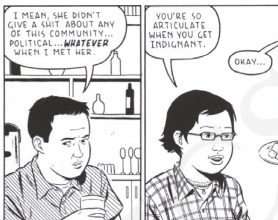
Fig 24. Tomine, A. (2012). Shortcomings . London: Faber and Faber, p. 14.

‘Whatever’ translates into Polish as “cokolwiek.” It cannot be used in this context in Polish as the phrase “polityczne cokolwiek” ( political whatever ) is not something a Pole would say. The use of the word ‘whatever,’ when a speaker is not able or cannot be bothered to find an appropriate, meaningful way to express themselves, functions in English, but in Polish it would not seem natural. Murawska chose the expression ‘hocki klocki’; the word ‘hocki’ is an old Polish onomatopoeic expression which signifies ‘jumping’; ‘klocki’ means ‘blocks,’ as in ‘the LEGO blocks.’ Together, these two words rhyme, and stand for meaningless, silly matters, unworthy of any attention. It is not a literary expression; in fact, it sounds a bit awkward and obsolete. For these reasons, it fits perfectly in Ben’s complaining about Miko’s interest in politics: