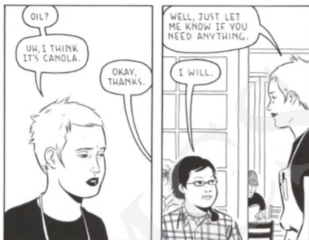
Fig 30. Tomine A. (2012). Shortcomings . London: Faber and Faber, p. 15.