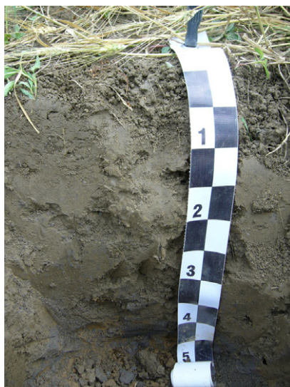
Fig. 3b. Occurrence of grey ash in the soil profile (at the depth of 30–50 cm) after the storm accident and destruction of waste deposit from energy industry in 1965 (Fluvisol) – Horná – Upper Nitra region (the same field above)