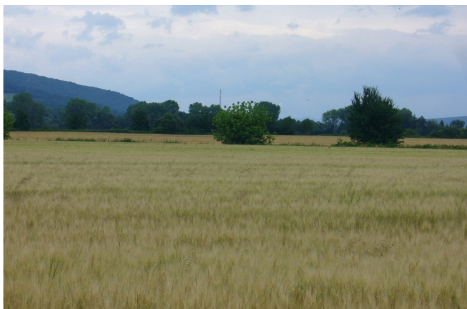
Fig. 3a. Agricultural land affected by arsenic in the Horná – Upper Nitra region

Explanations: n – frequency, X_{\min} – minimum value, X_{\max} – maximum value, X – arithmetic mean, Sd – standard deviation, CV – coefficient of variation