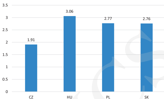
Figure 1. Yearly ESIF funds from EU (2014–2020) in the share of the average of 2014–2020 GDP (current market prices; %)