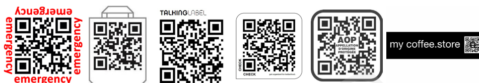
Figure 2. QR codes: a) emergency; b) Powa Technologies Limited; c) Talking Label; d) CHECK get organized for better food; e) AOP appellation d'origine protégée; f) my coffee.store

Source: EUTM 012609616, registration sought in classes 9, 16, 41; EUTM 014396766, registration sought in classes 9, 35, 36, 38, 42; EUTM 011298155, registration sought in classes 29, 30, 32, 33, 35, 41; EUTM 016530461, registration sought in classes 9, 35, 38, 42; EUTM 010266203, registration sought in classes 9, 32, 33, 34; EUTM 018061024, registration sought in classes 35 and 43.