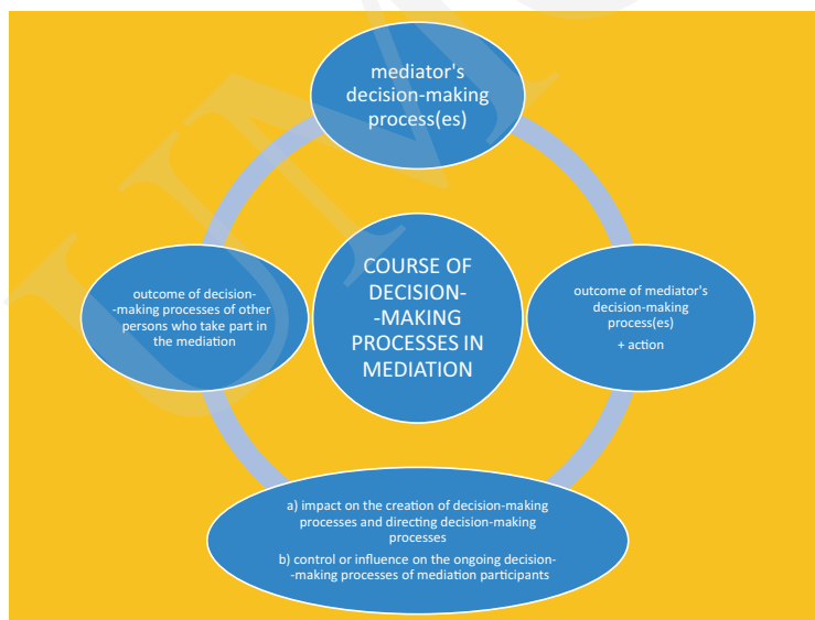
Figure 1. Course of decision-making processes in mediation

all mediation participants. The decision-making participation will consist of a real collective effect on the outcome of decisions made during mediation. Any decision, except for the first one which initiates the mediation process, will be a consequence of previous decisions (see Figure 1). I accept that competent to make decisions in mediation are ‘actors’, i.e. the mediators, parties, attorneys, and other persons involved in mediation (e.g. experts). 43 The mediator plays an essential role in the process, enabling mutual communication 44 and organising the resulting information system. This perception of decision-making processes in mediation entails that we focus on the actual course of decision-making and not on the formal powers to make a decision. At the same time, the course of decision-making processes takes into account the interaction of decision-making processes and actions of all people involved in mediation, taking into account the strong interconnection. 45