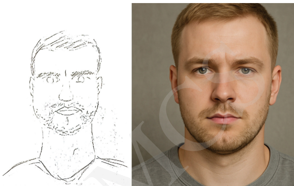
Figure 3. Image of a human being generated by ChatGPT based on a hand-drawn sketch and description