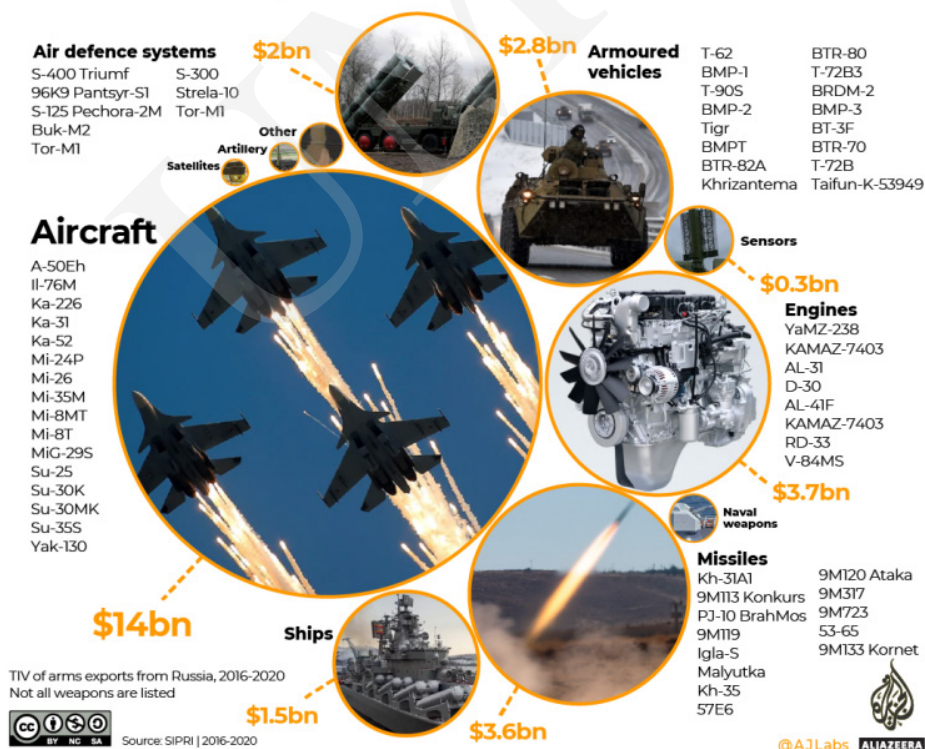
Fig. 2. Types of Weapons, which Russia exported to the International Market within 2016–2020

Half of Russia's arms exports are aircraft. Many Russian weapons are upgrades to its Soviet-era arsenal but it is developing more advanced systems . Between 2016 and 2020, Moscow sold $28bn of weapons to 45 countries.