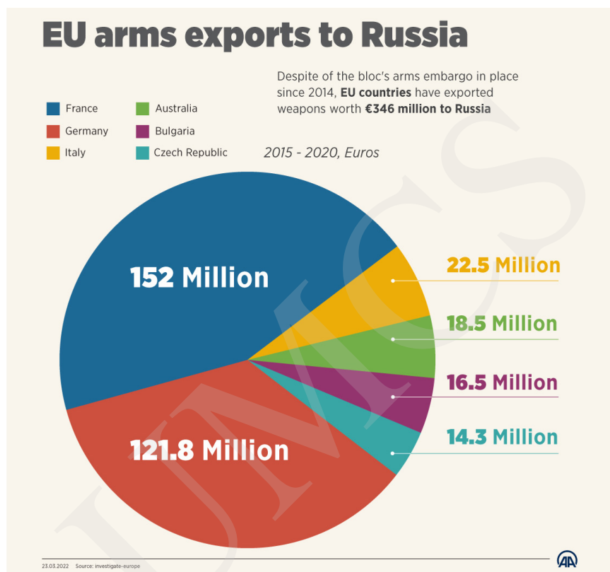
Fig.3. EU Arms Exports to Russia within 2015–2020